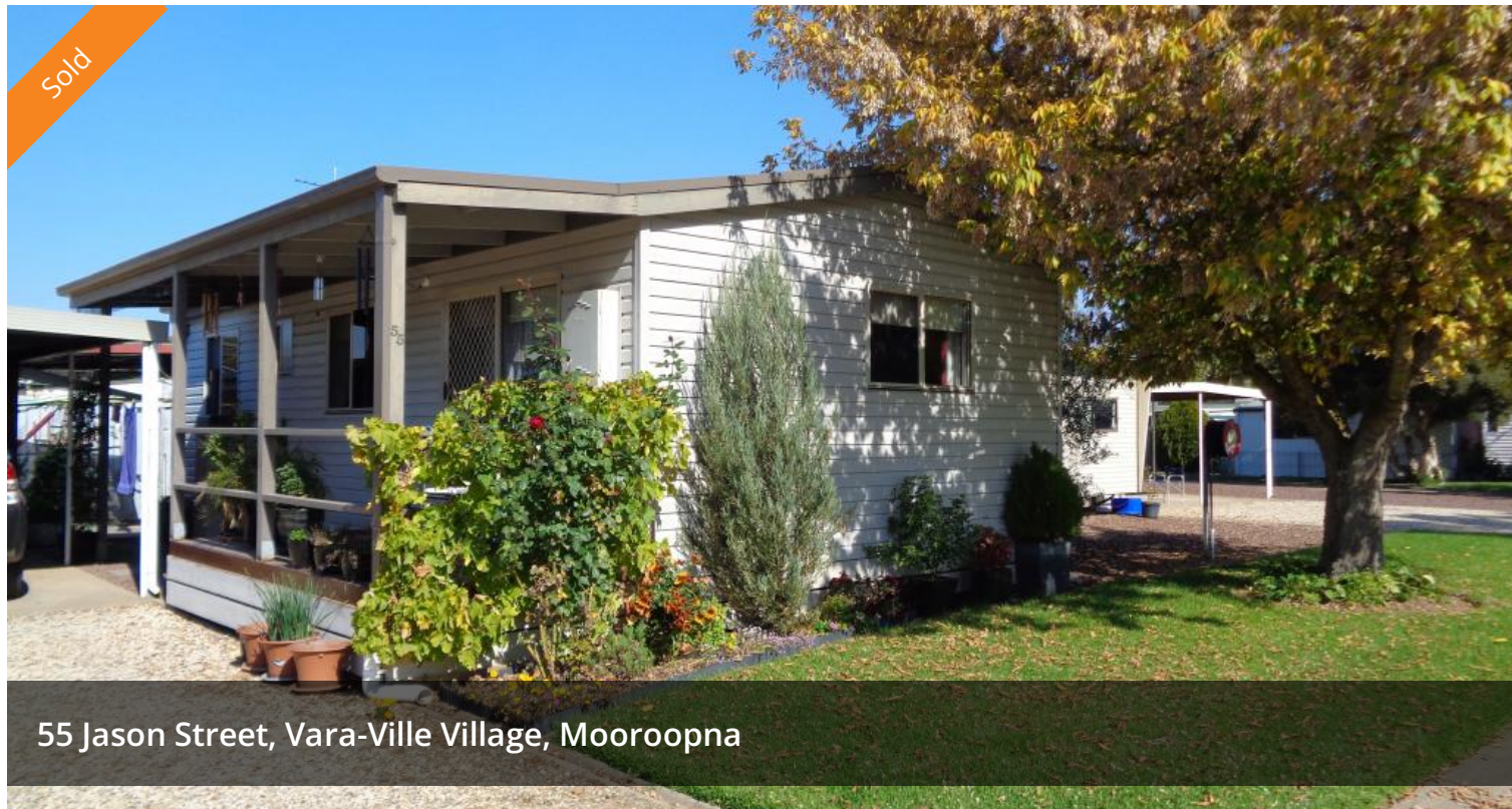
55 Jason Street, Vara-Ville Village, Mooroopna