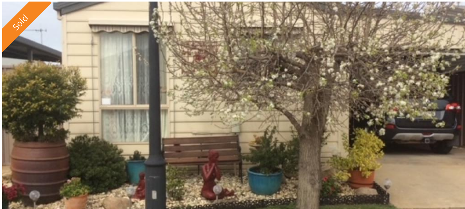
Unit 12, 96-106 Elsie Jones Drive, Mooroopna