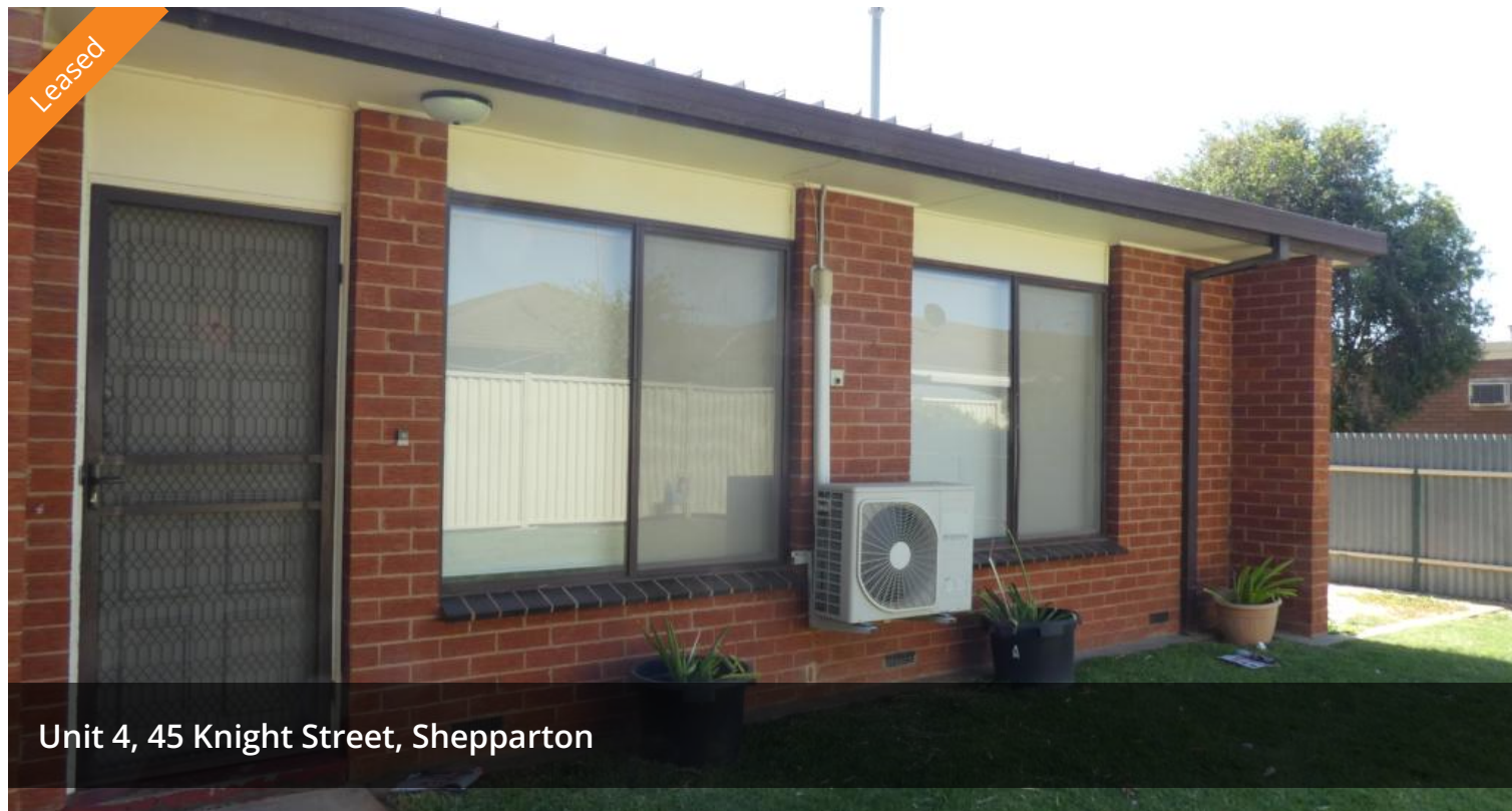
Unit 4, 45 Knight Street, Shepparton