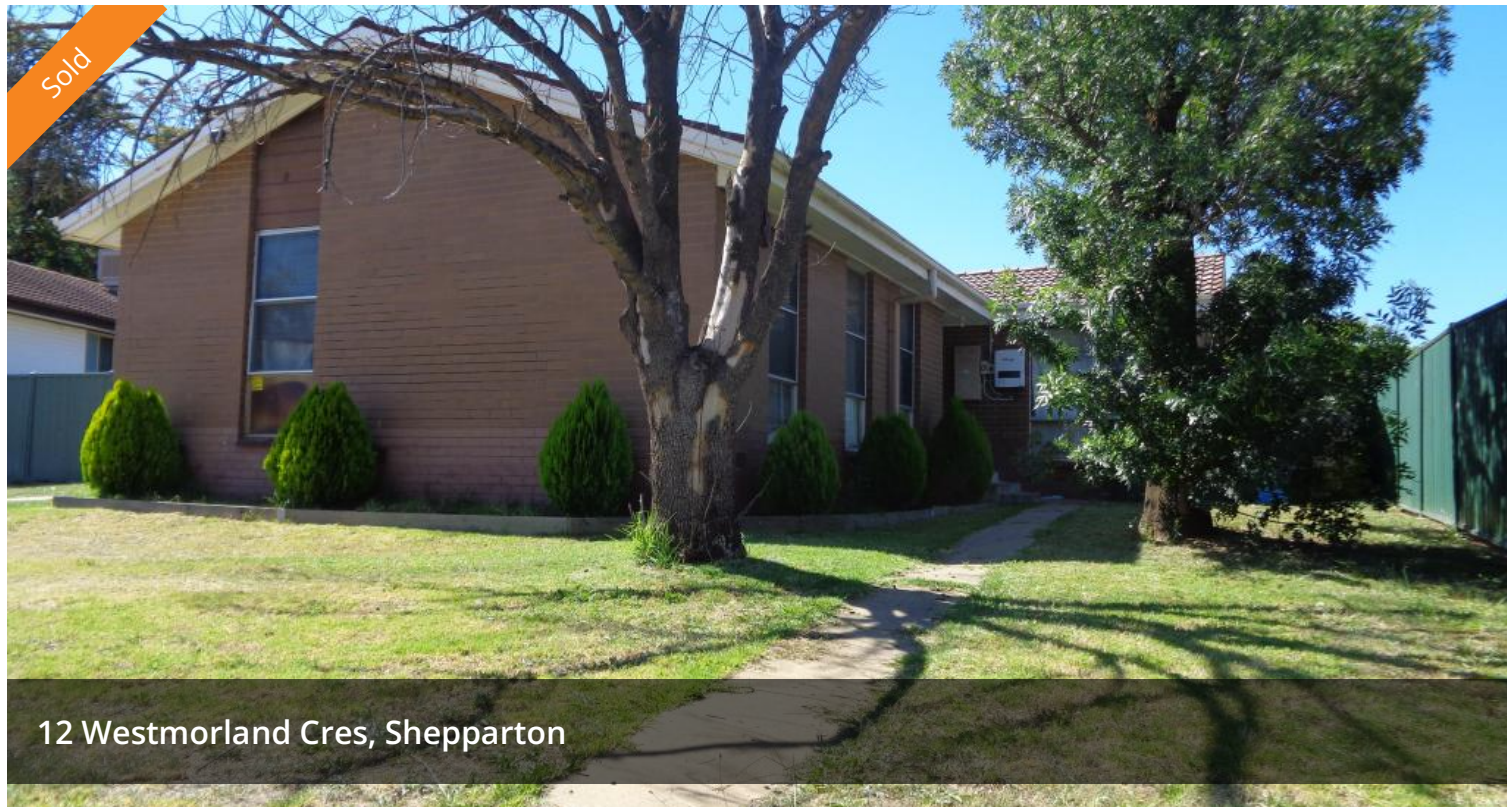
12 Westmorland Cres, Shepparton