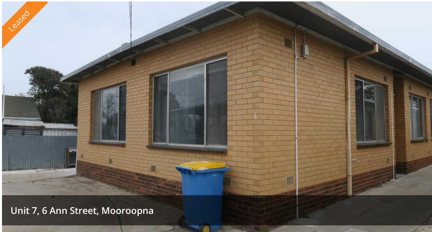
Unit 7, 6 Ann Street, Mooroopna