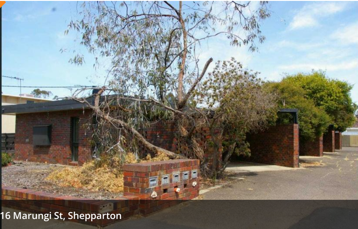
Unit 2, 16 Marungi St, Shepparton