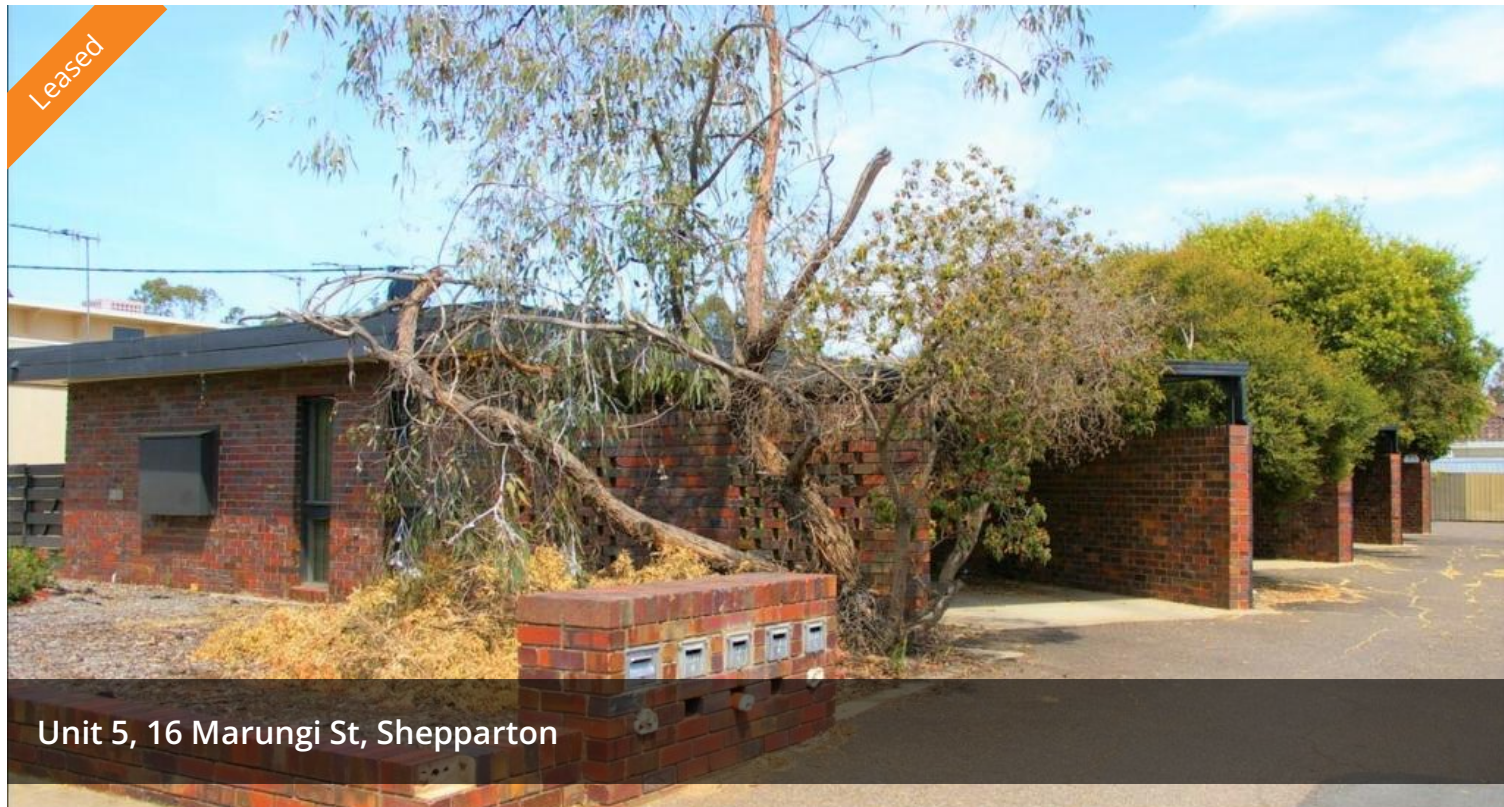
Unit 5, 16 Marungi St, Shepparton