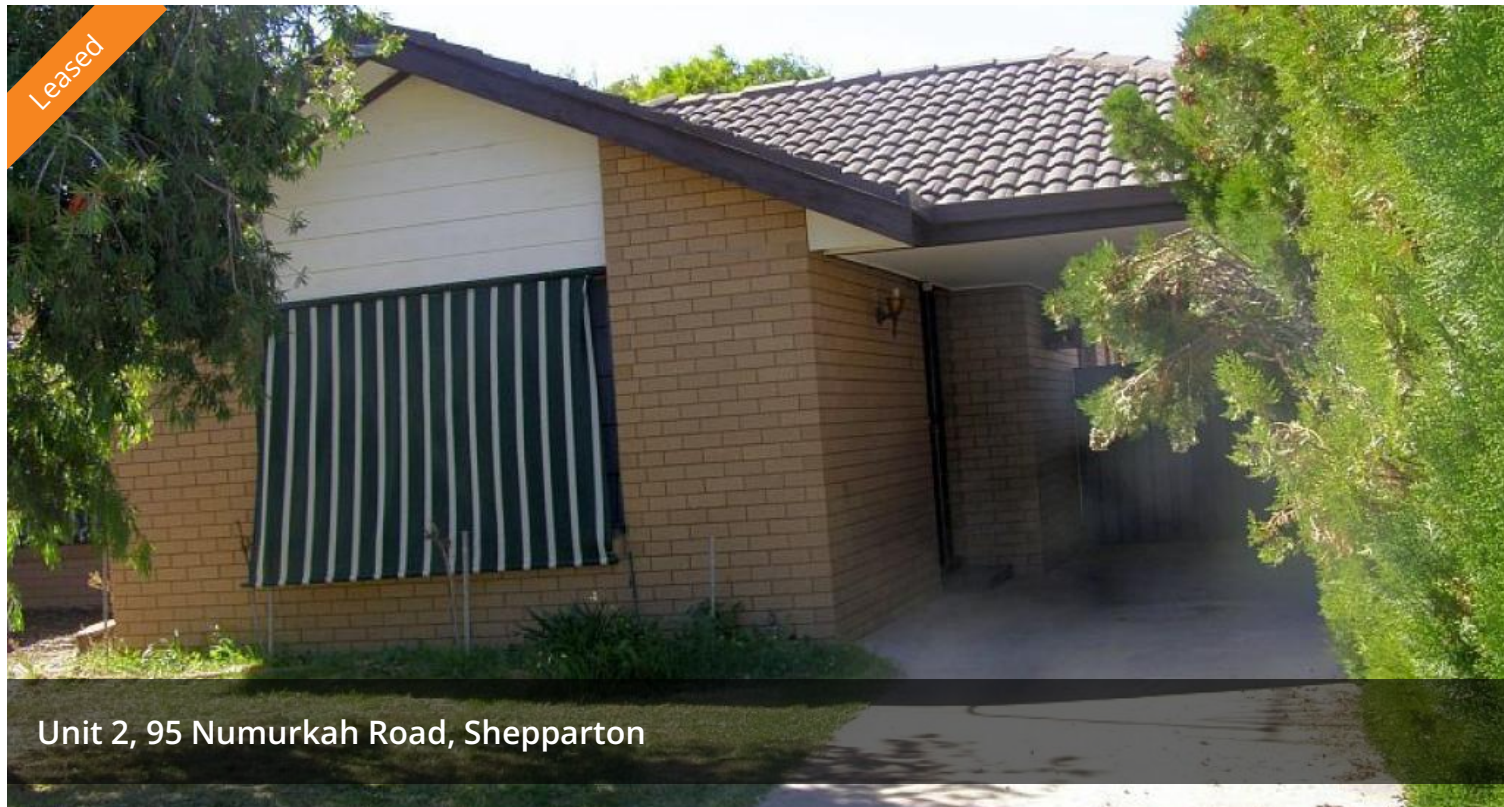
Unit 2, 95 Numurkah Road, Shepparton