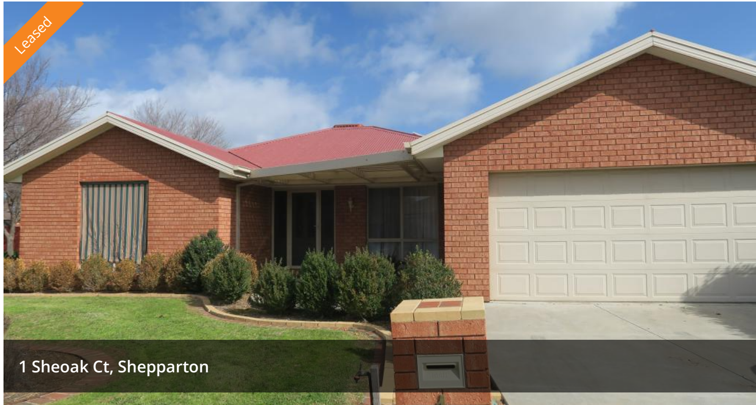
1 Sheoak Ct, Shepparton