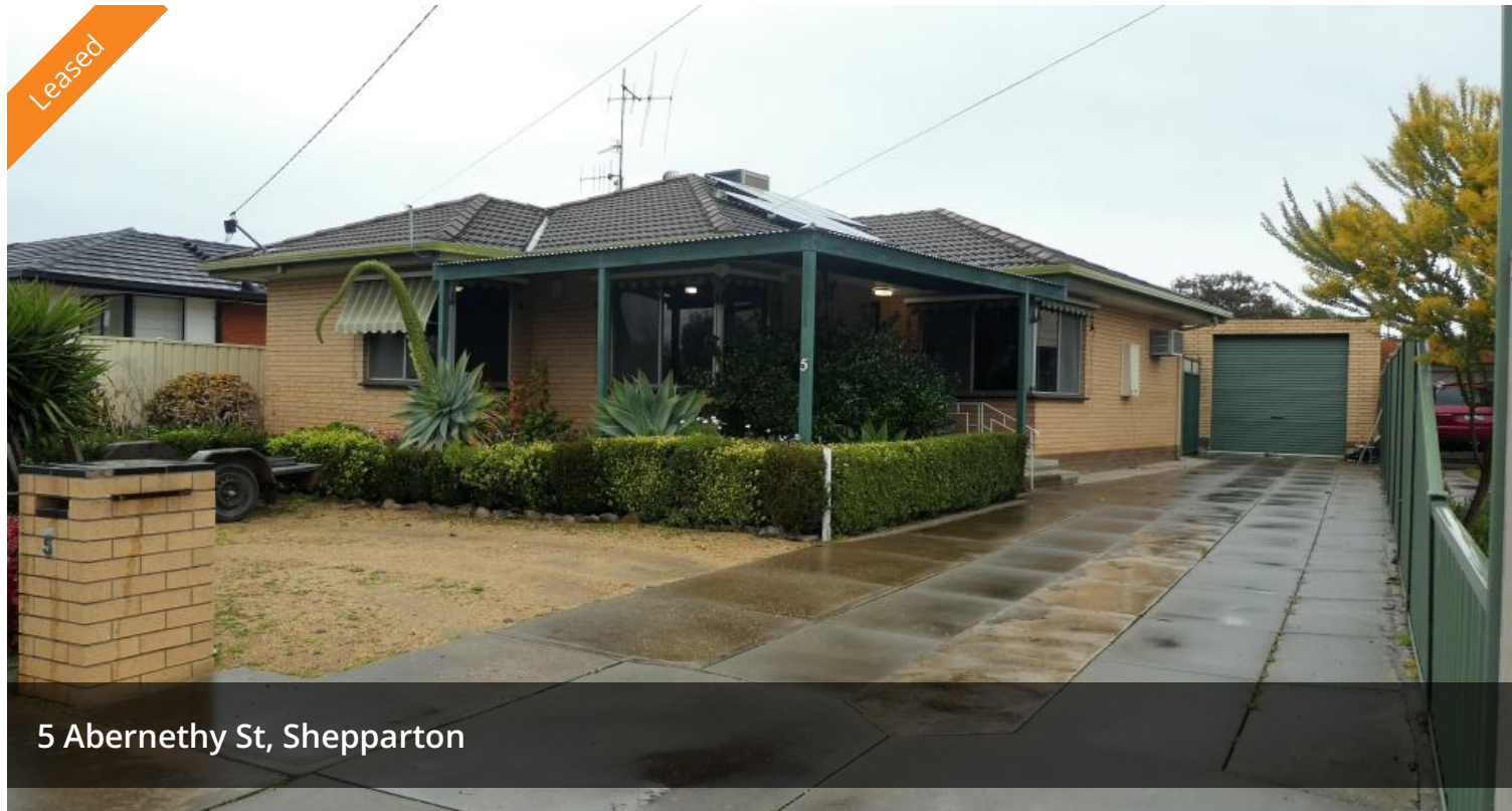
5 Abernethy St, Shepparton