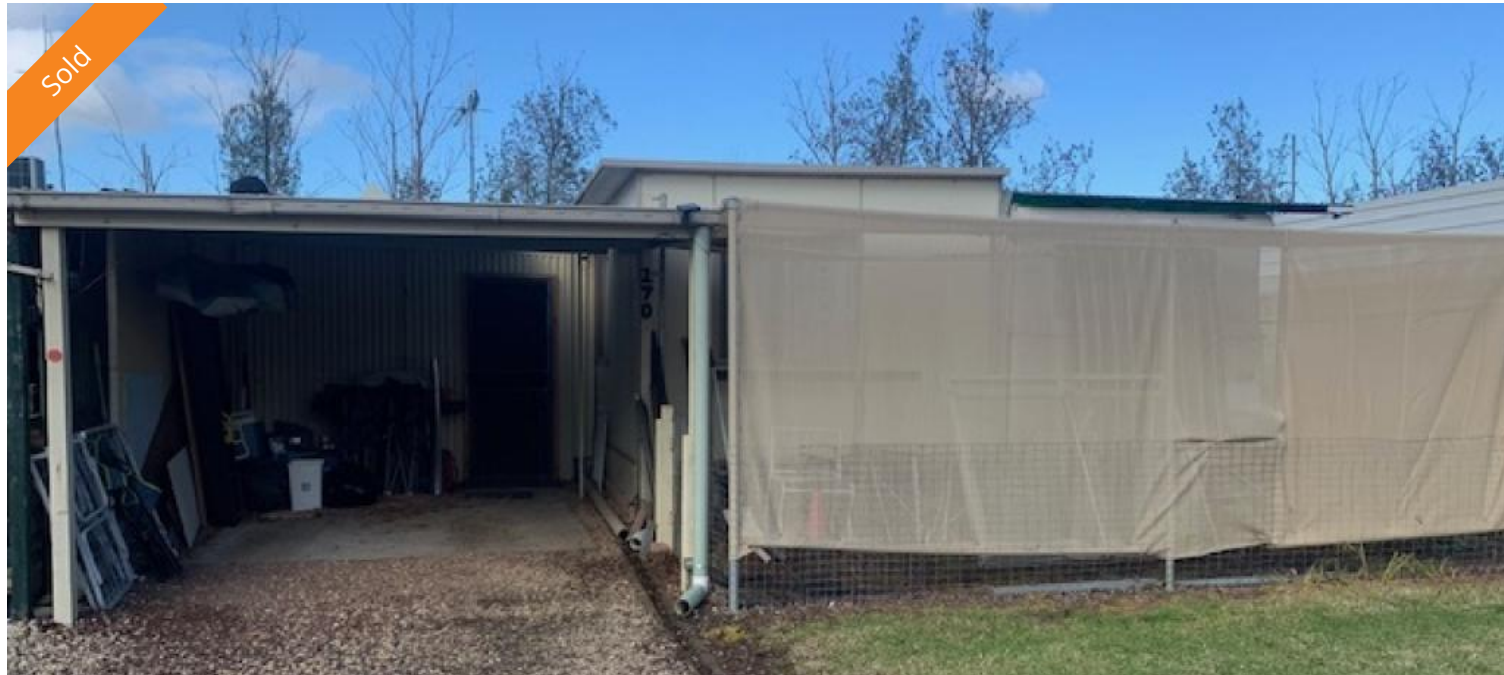
170 David Street Vara - Ville Village, Mooroopna