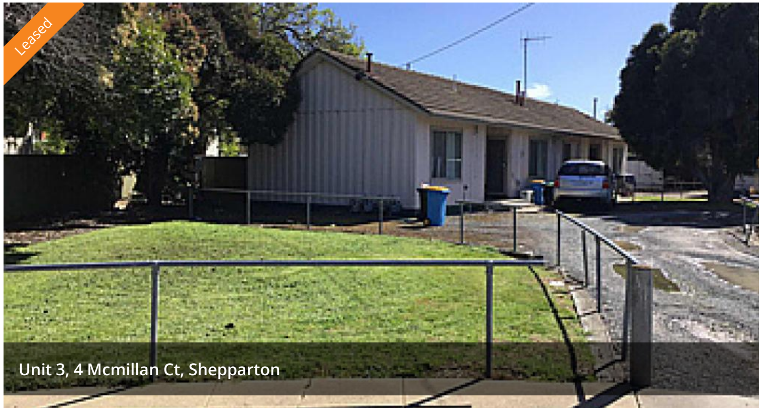
Unit 3, 4 Mcmillan Ct, Shepparton