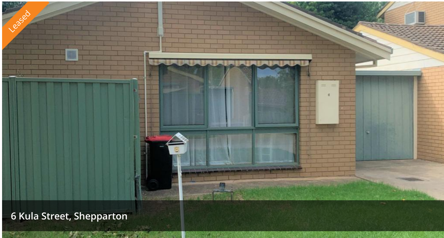
6 Kula Street, Shepparton