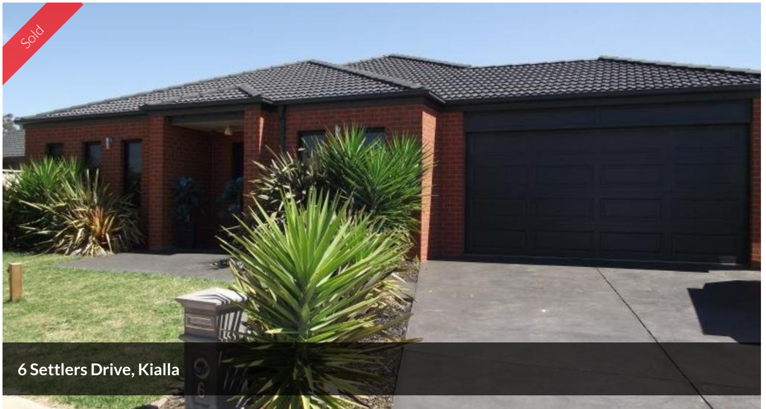
6 Settlers Drive, Kialla