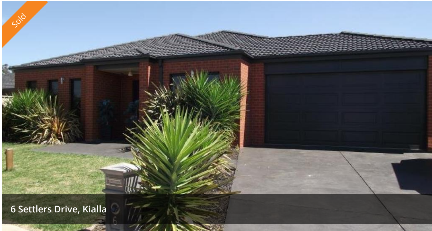
6 Settlers Drive, Kialla