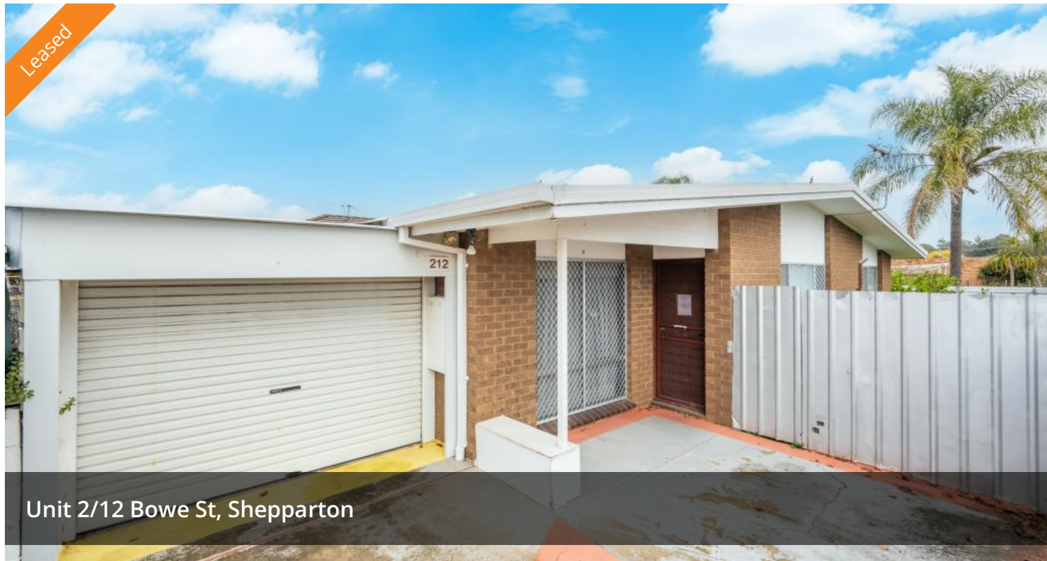
Unit 2/12 Bowe St, Shepparton