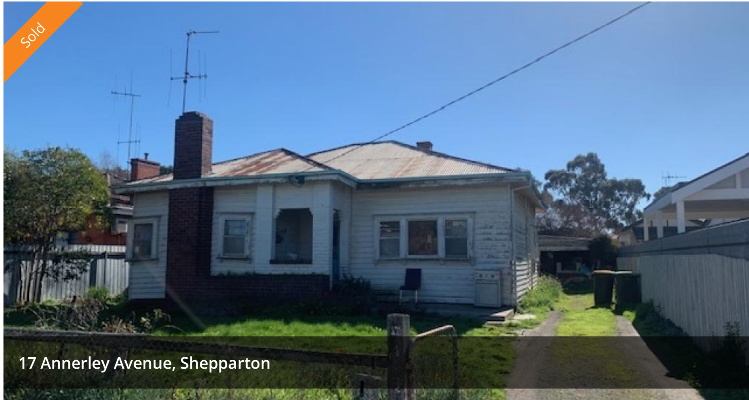
17 Annerley Avenue, Shepparton