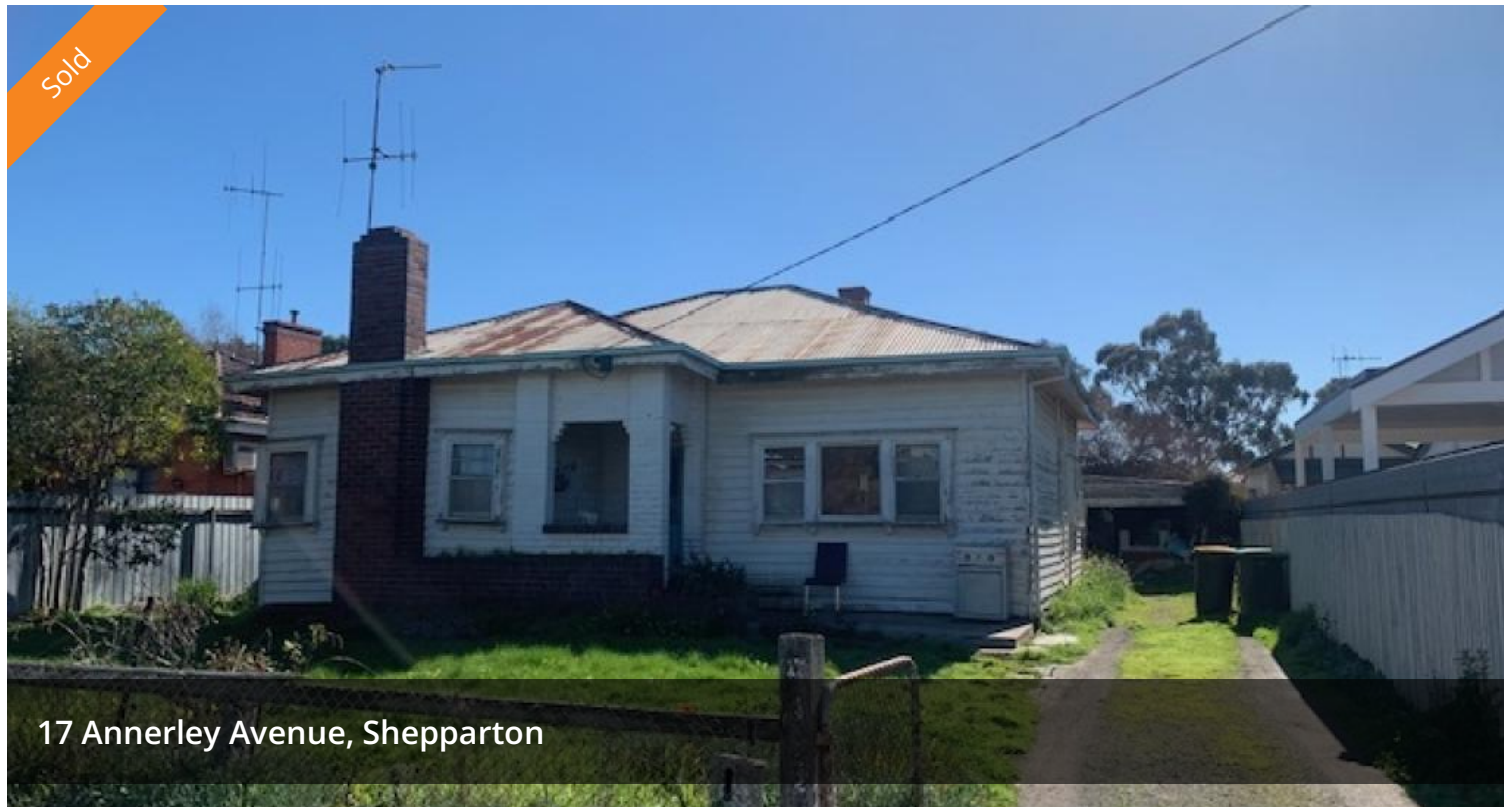
17 Annerley Avenue, Shepparton