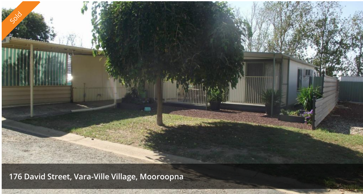
176 David Street, Vara-Ville Village, Mooroopna