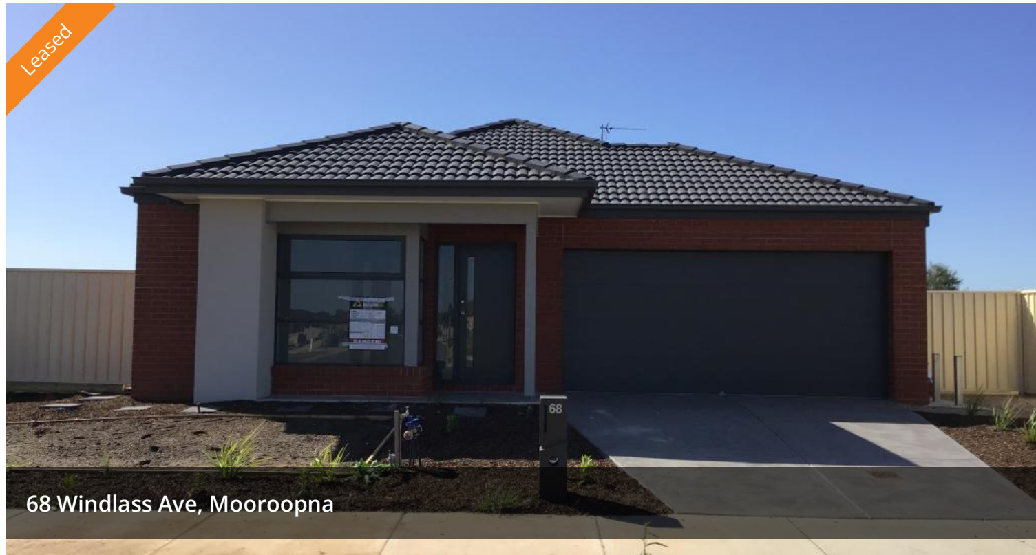
68 Windlass Ave, Mooroopna