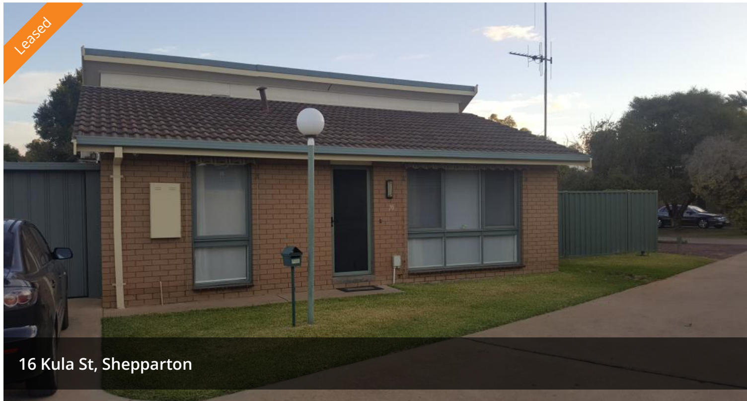
16 Kula St, Shepparton