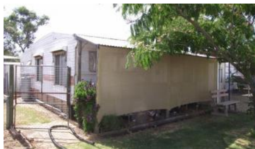
Villa, 133 Jodie Street, Mooroopna