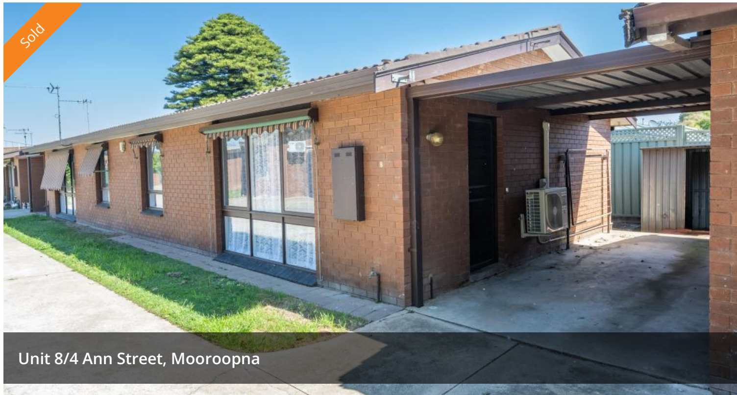
Unit 8/4 Ann Street, Mooroopna