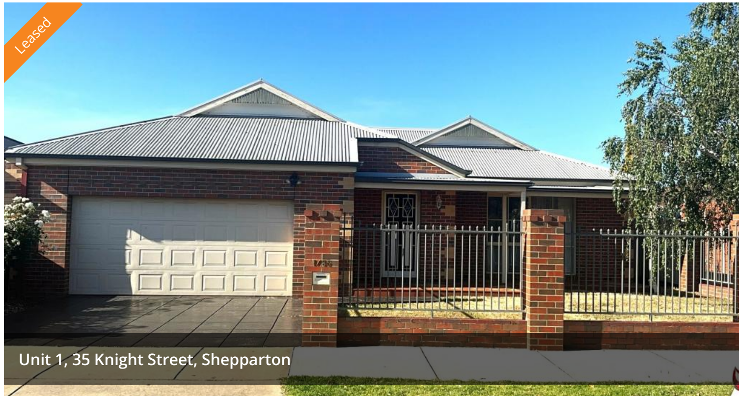
Unit 1, 35 Knight Street, Shepparton