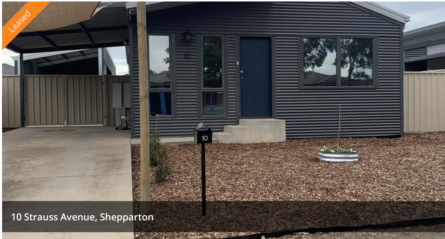
10 Strauss Avenue, Shepparton