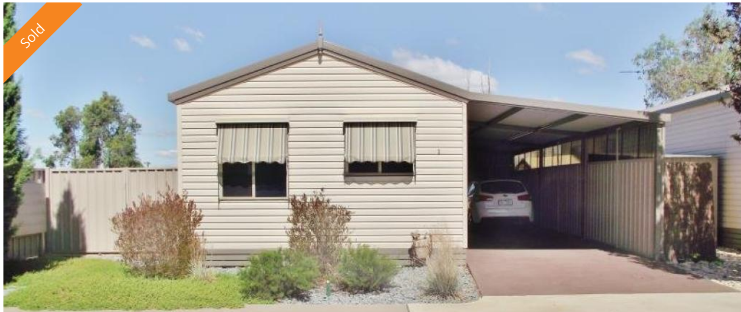
Unit 1, 106 Elsie Jones Drive, Mooroopna