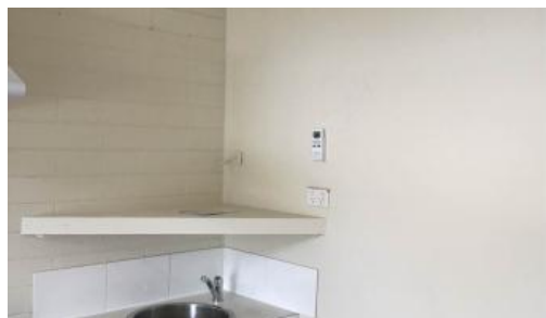
Unit 4, 46 Tocumwal Rd, Numurkah