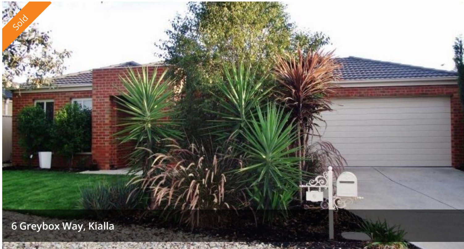
6 Greybox Way, Kialla