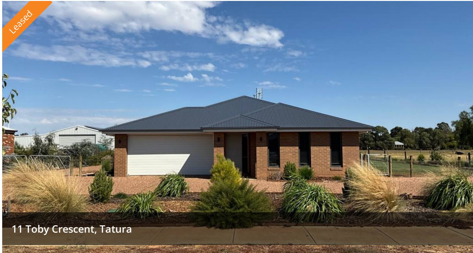
11 Toby Crescent, Tatura