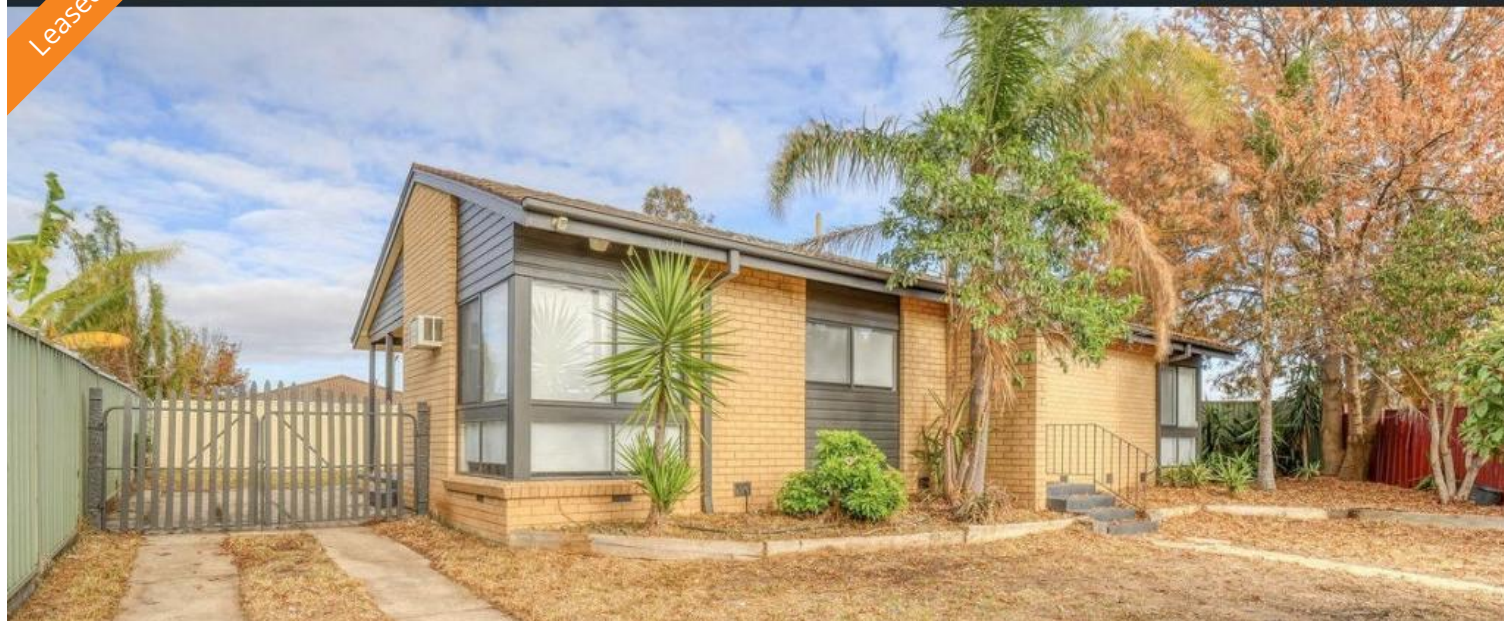
4 Carlos Court, Shepparton