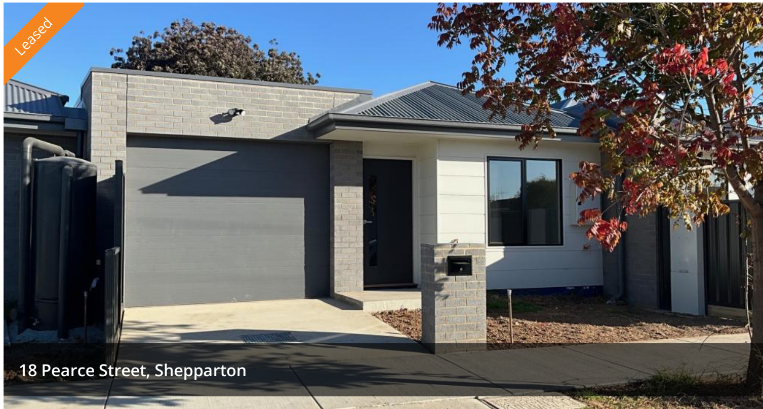
18 Pearce Street, Shepparton