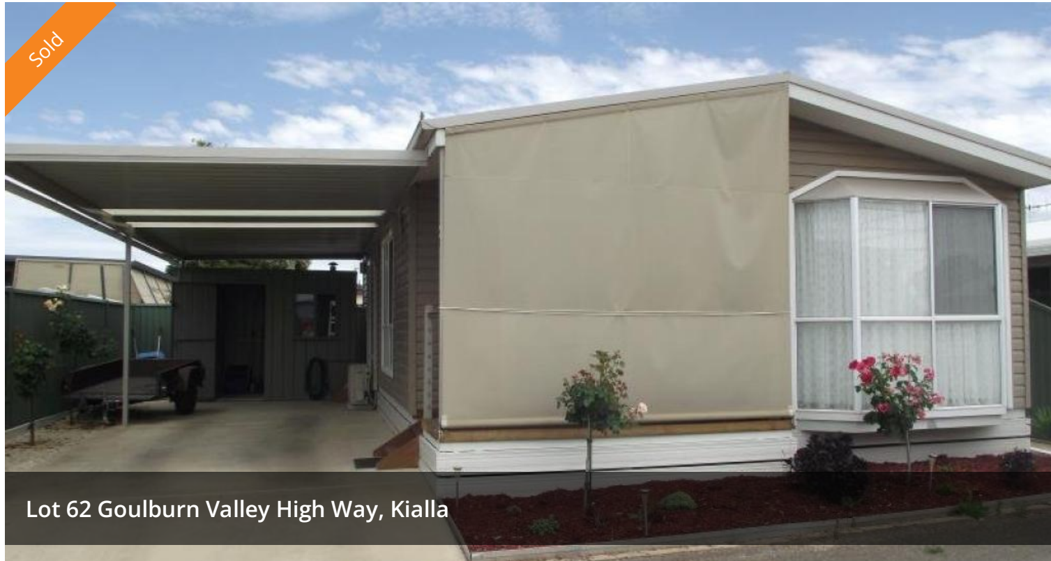
Lot 62 Goulburn Valley High Way, Kialla