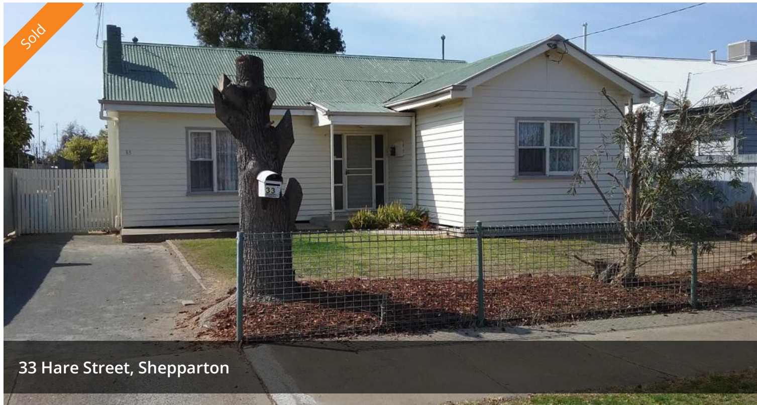
33 Hare Street, Shepparton