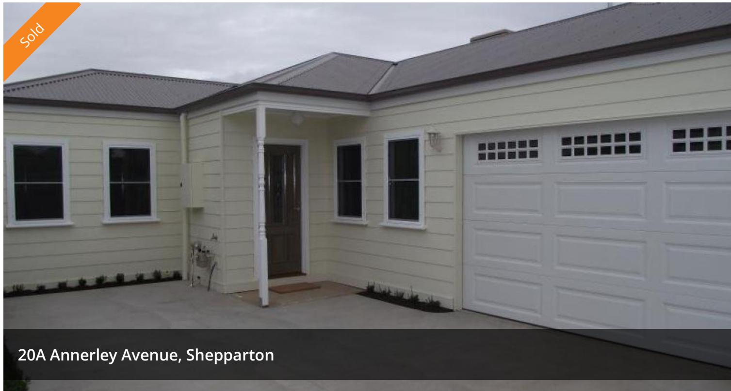
20A Annerley Avenue, Shepparton