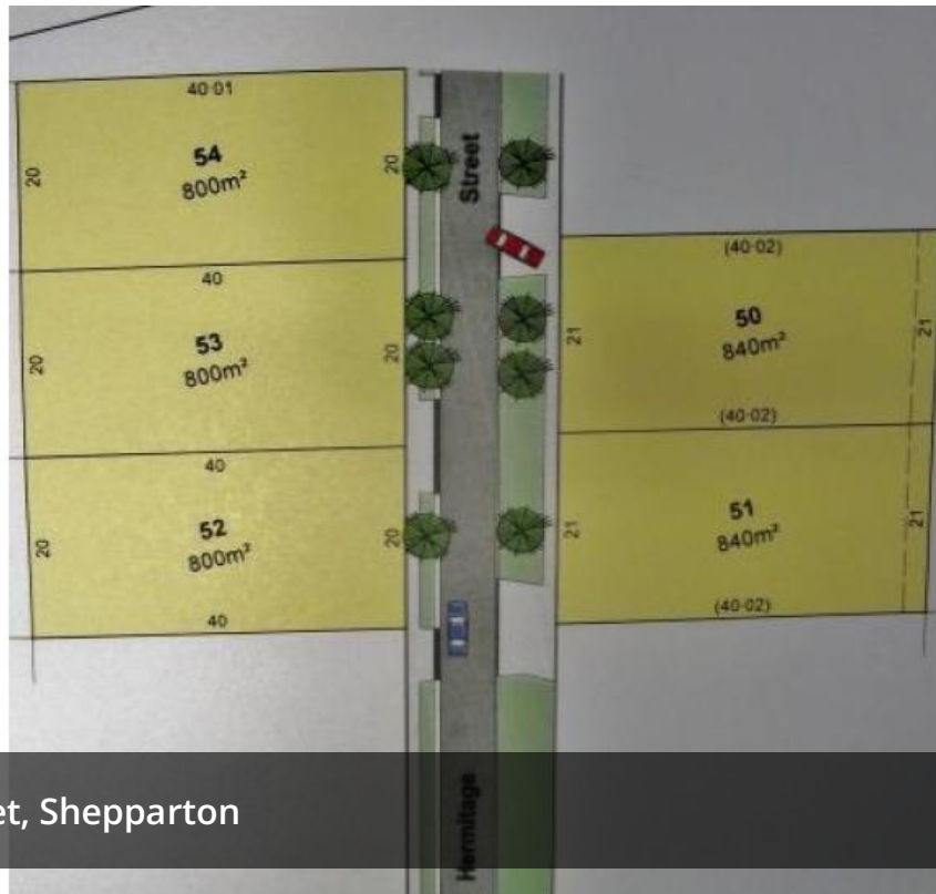
50 Hermitage Street, Shepparton