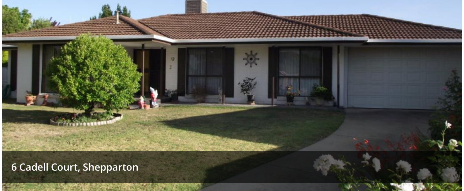
6 Cadell Court, Shepparton