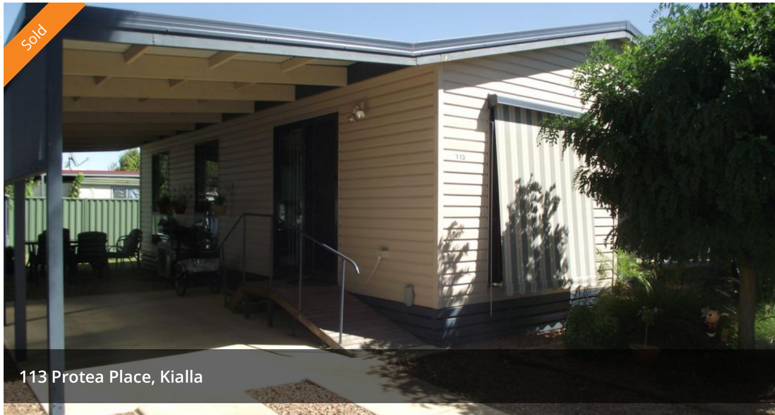
113 Protea Place, Kialla