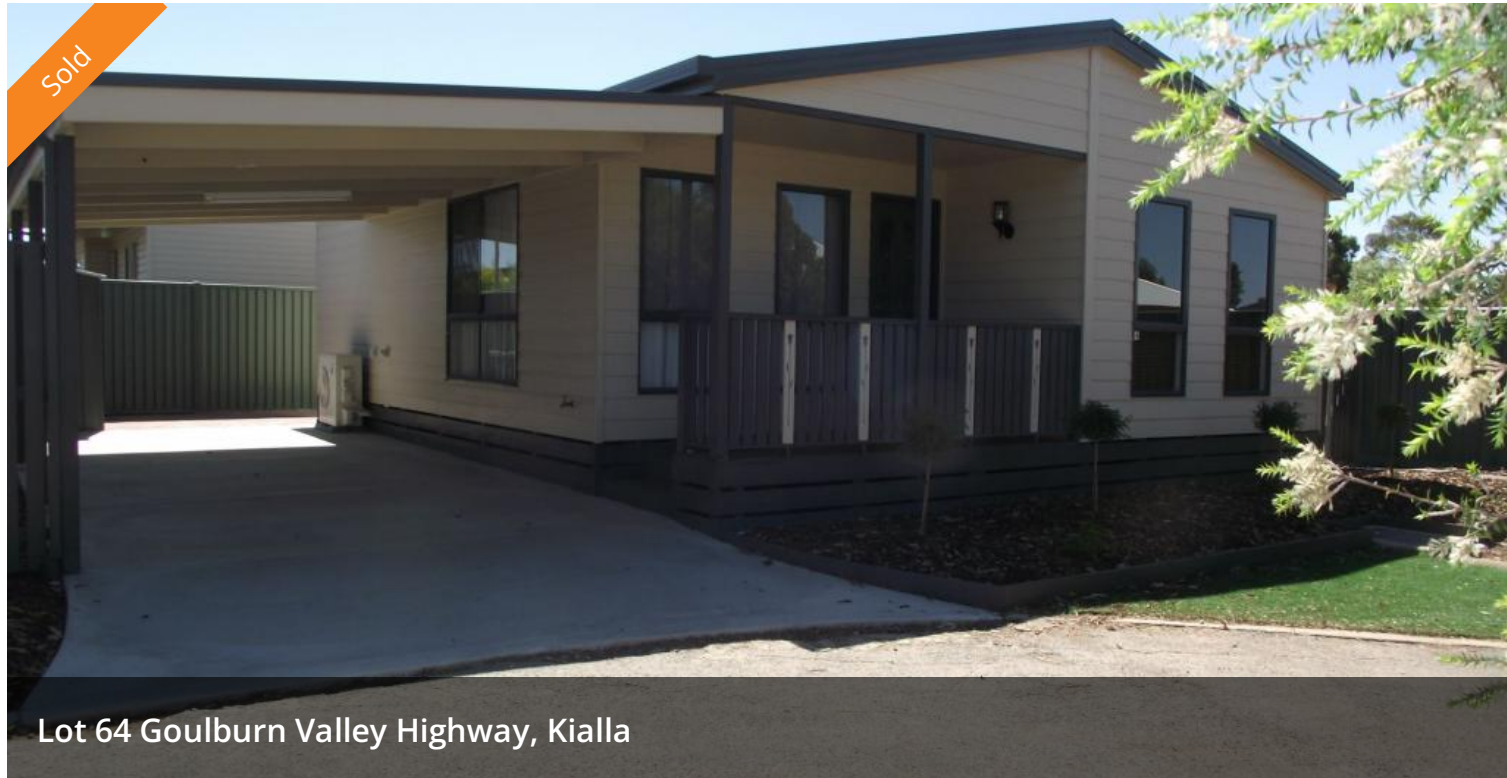
Lot 64 Goulburn Valley Highway, Kialla