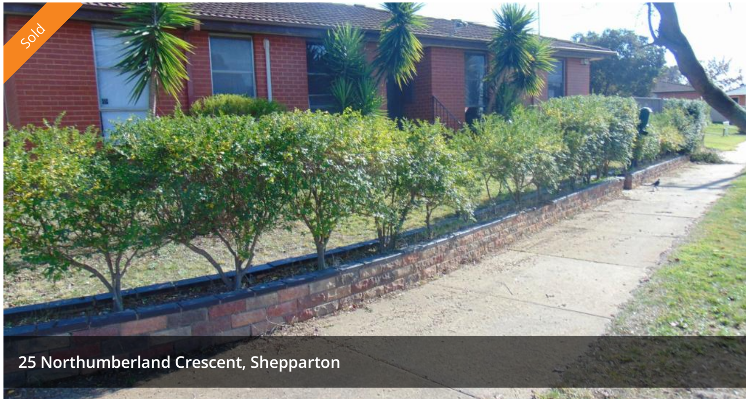
25 Northumberland Crescent, Shepparton