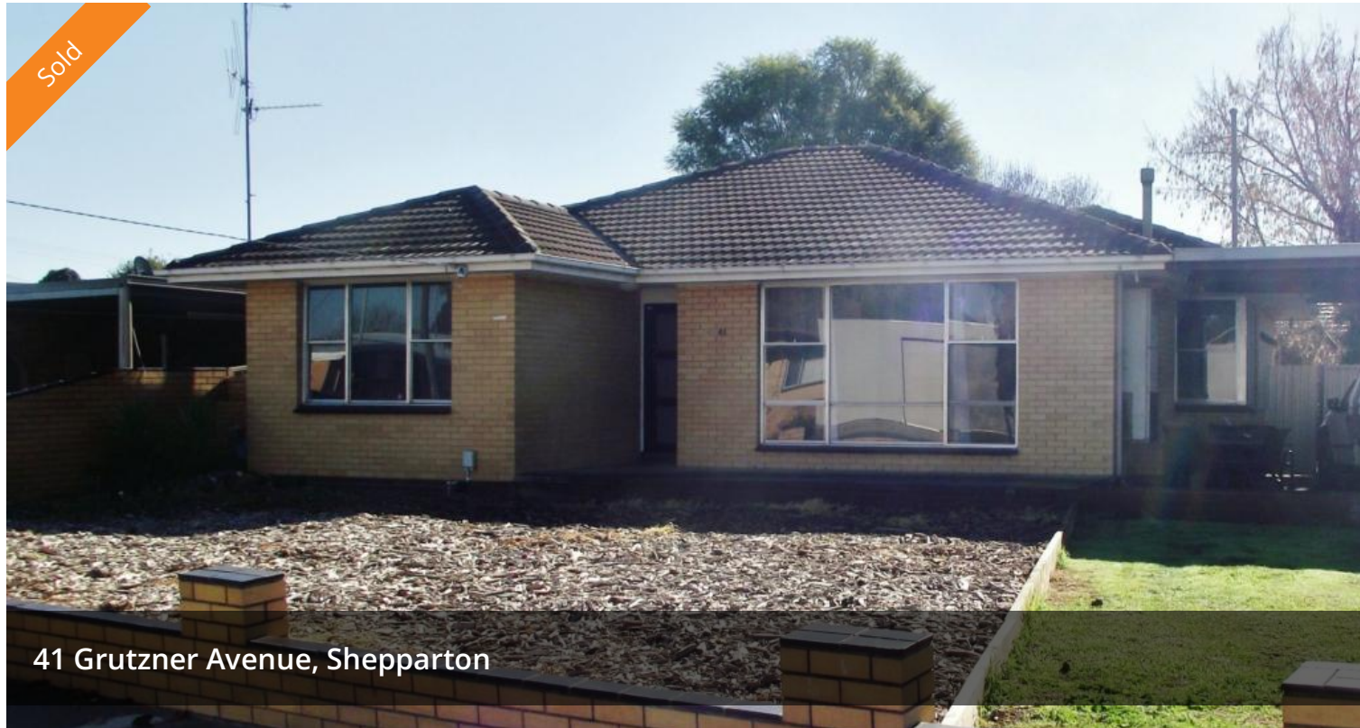
41 Grutzner Avenue, Shepparton