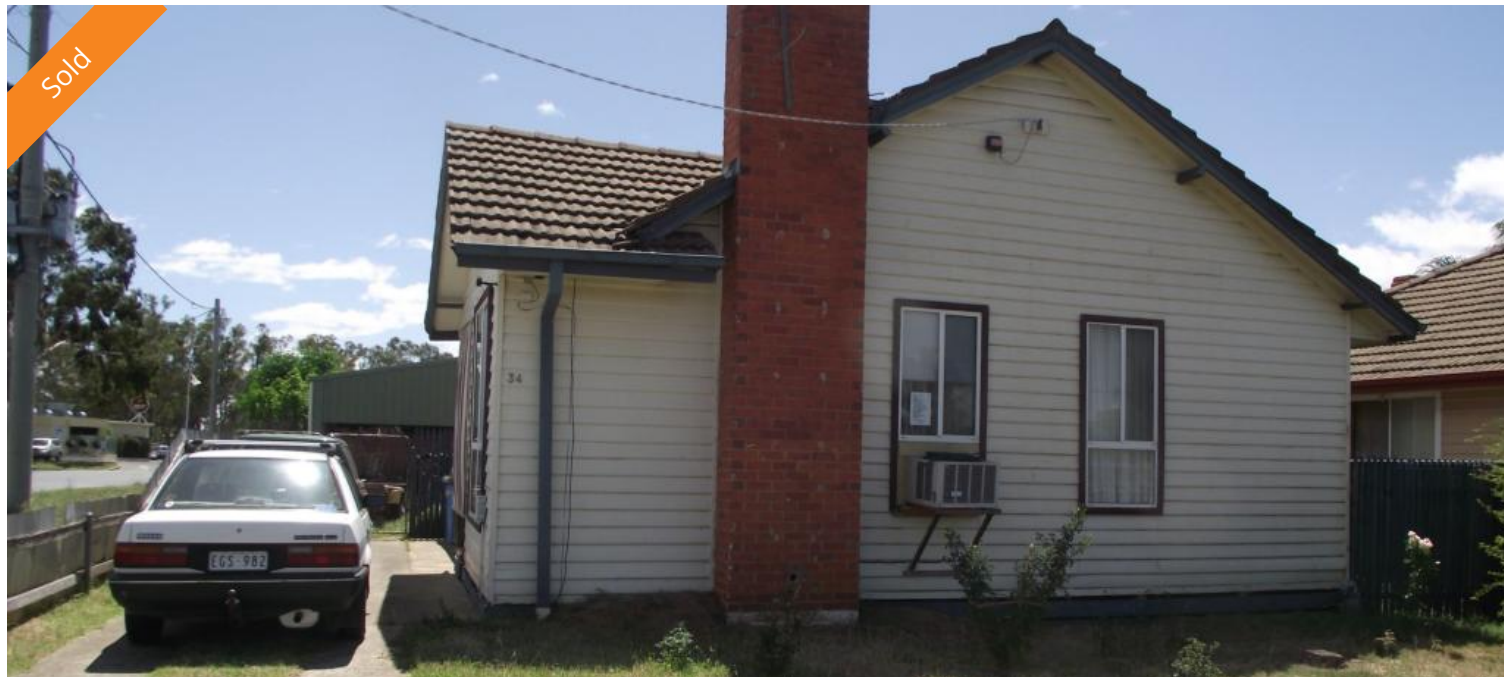
34 Elizabeth Street, Mooroopna