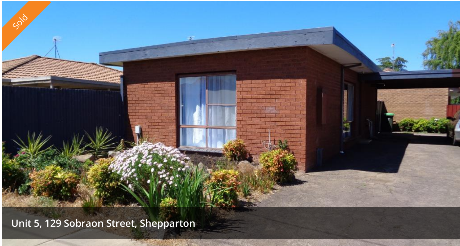
Unit 5, 129 Sobraon Street, Shepparton