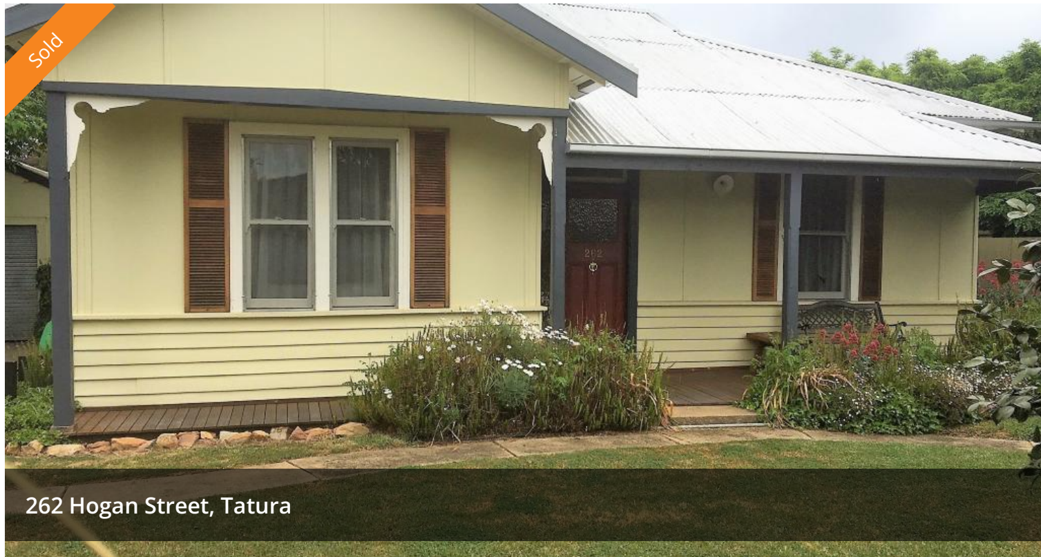
262 Hogan Street, Tatura