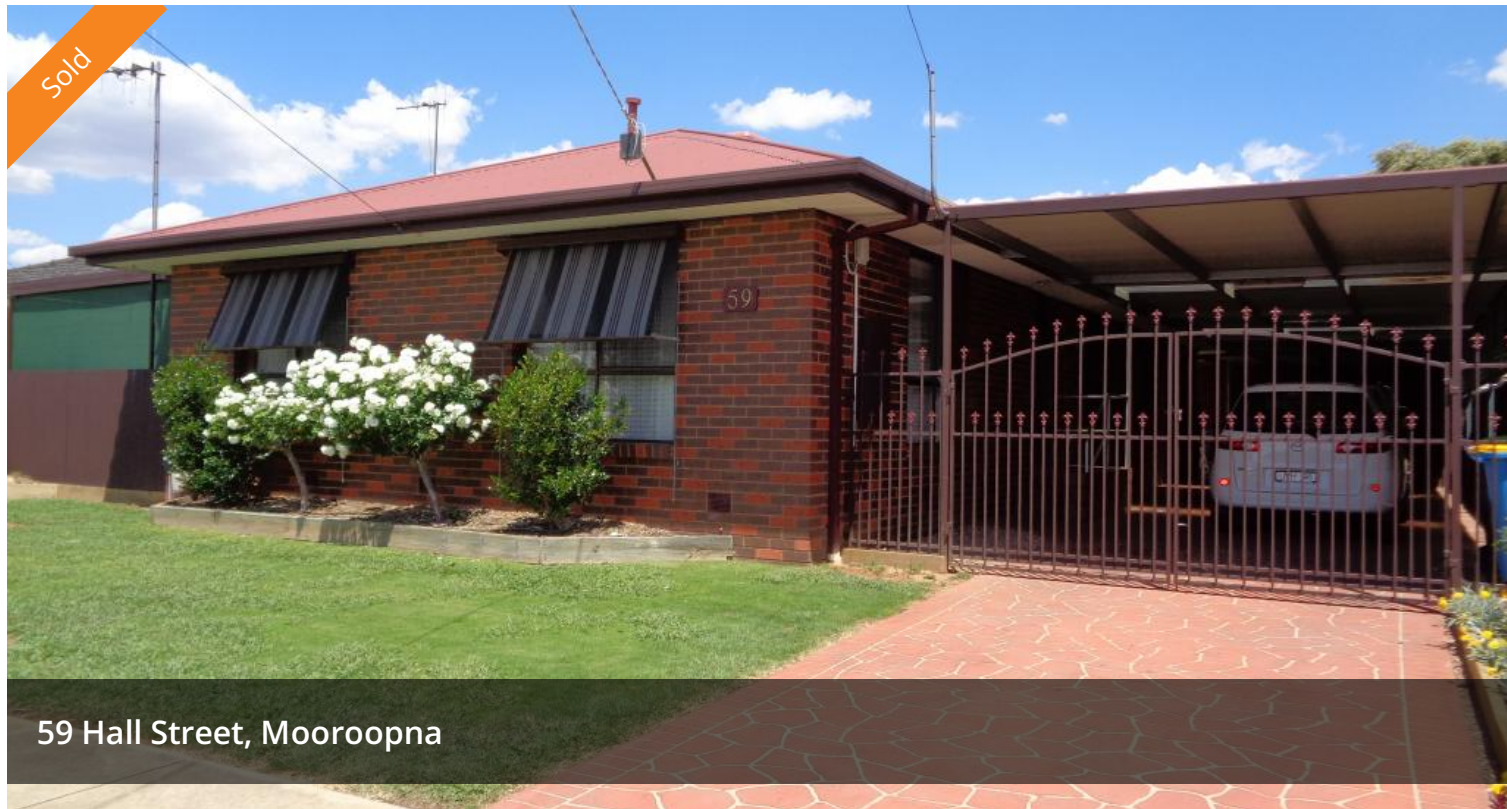
59 Hall Street, Mooroopna