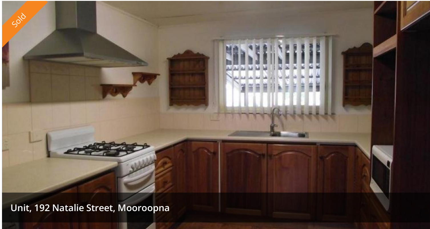
Unit, 192 Natalie Street, Mooroopna