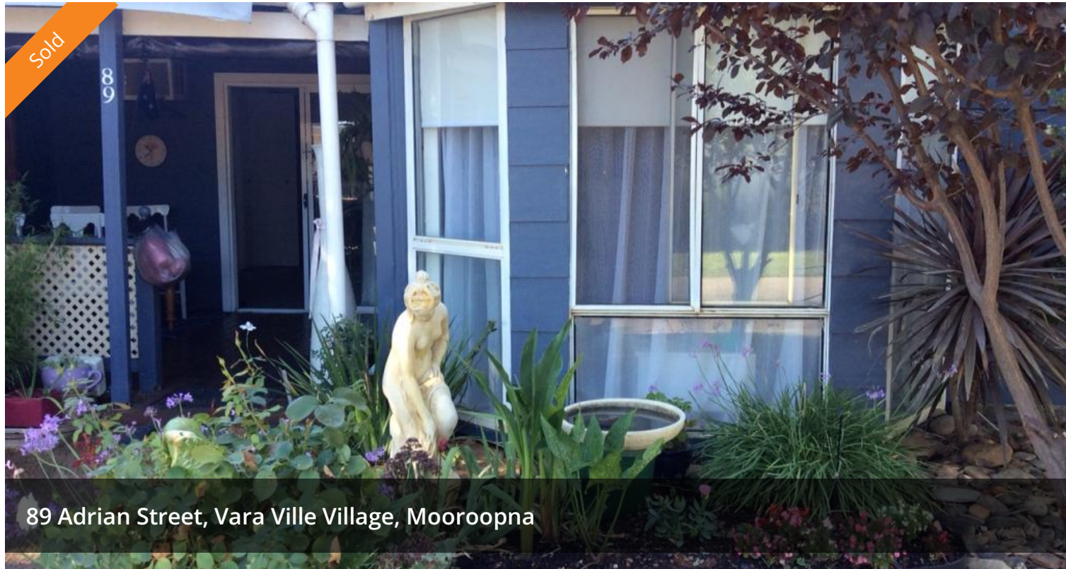
89 Adrian Street, Vara Ville Village, Mooroopna