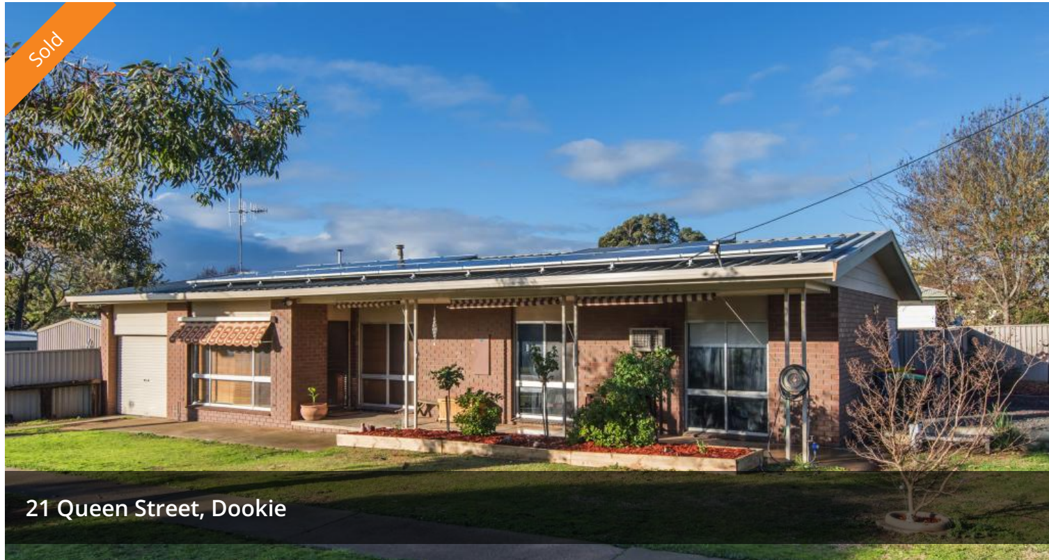
21 Queen Street, Dookie