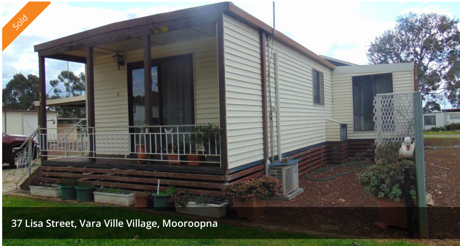
37 Lisa Street, Vara Ville Village, Mooroopna