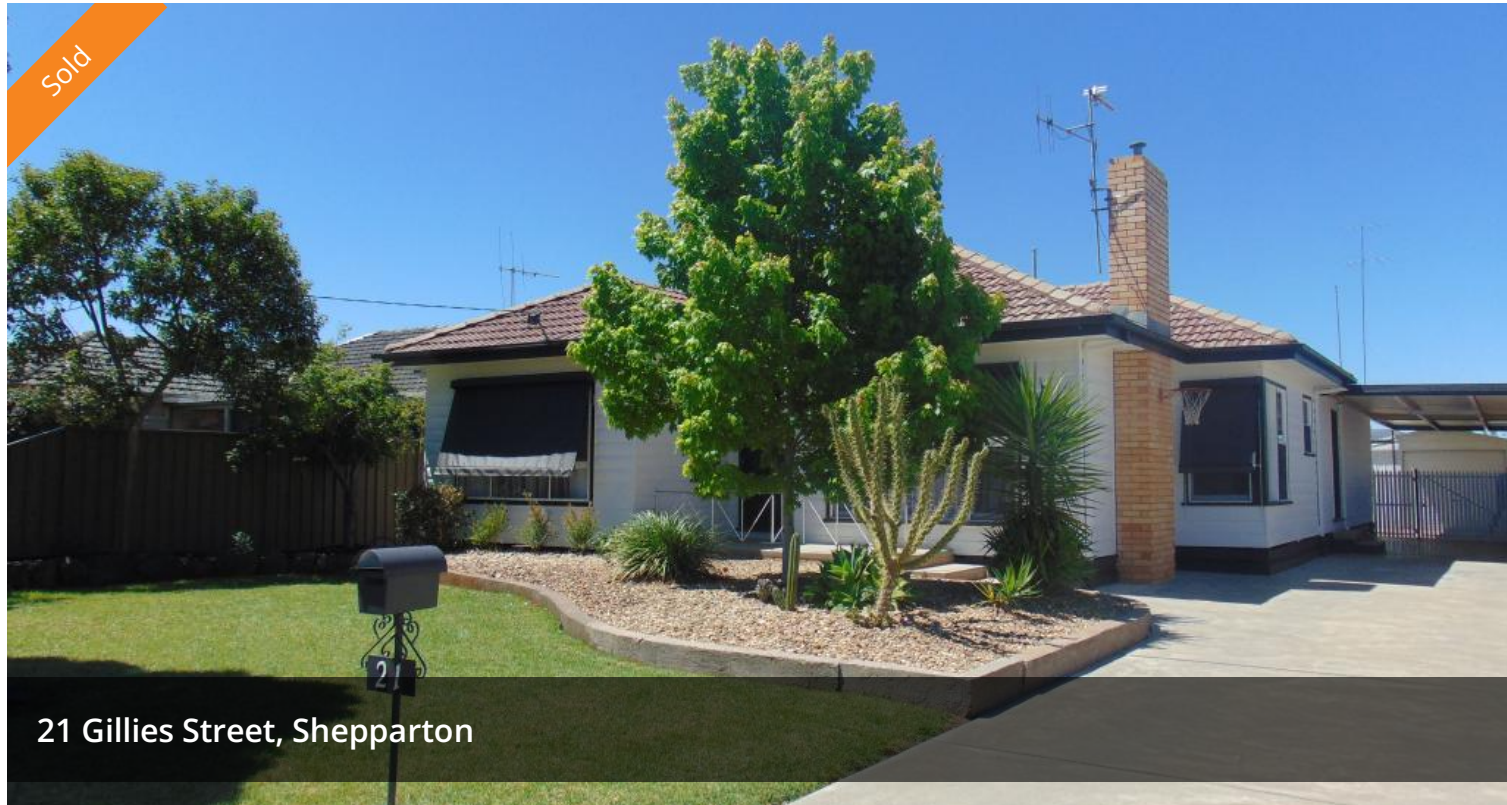
21 Gillies Street, Shepparton