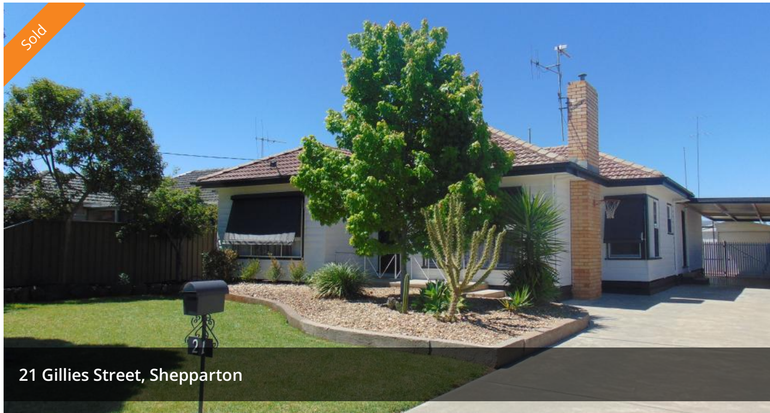
21 Gillies Street, Shepparton