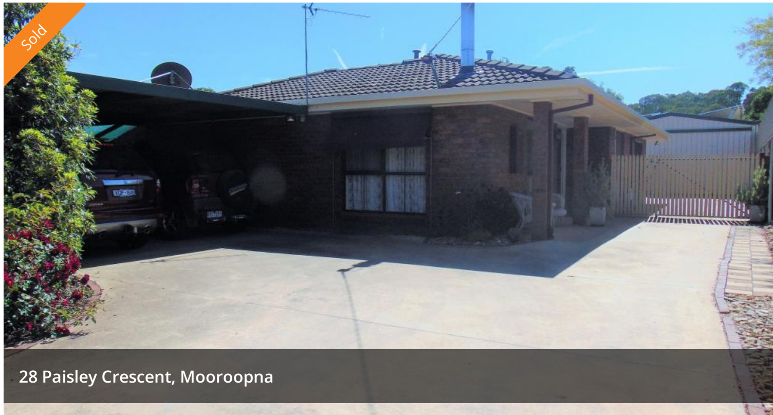
28 Paisley Crescent, Mooroopna