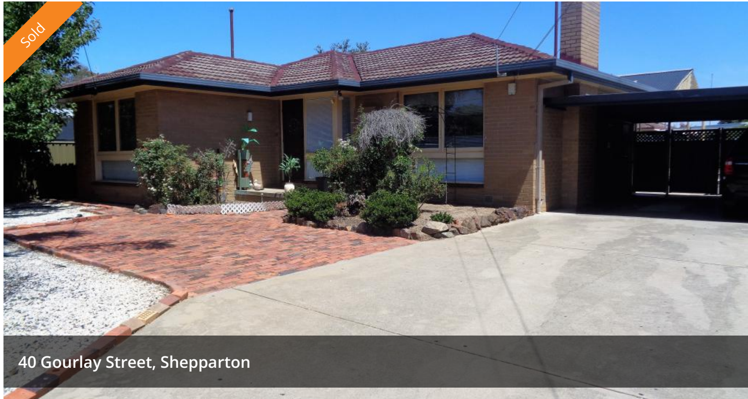
40 Gourlay Street, Shepparton