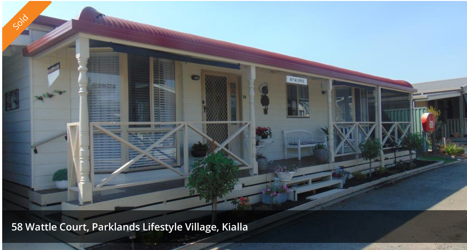
58 Wattle Court, Parklands Lifestyle Village, Kialla